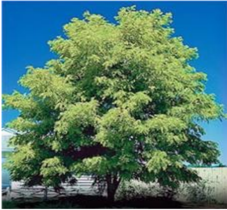
Thornless Honey Locust

⇒ For every 10 trees sold, the student will win a $5 QT gift card